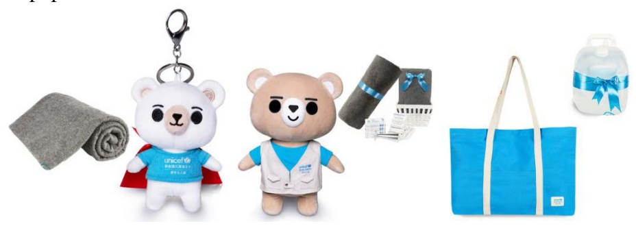
Figure 3. Samples of promotional products

In conclusion, based on the SWOT analysis we did for UNICEF, we have noticed two major causes explaining why UNICEF has lacked market power in China: one is the insufficiency of the market campaign, and the other is the perception of philanthropy. As a result of these findings, our major suggestions for UNICEF is to enhance its product design and shift their target audiences to the younger Chinese population.